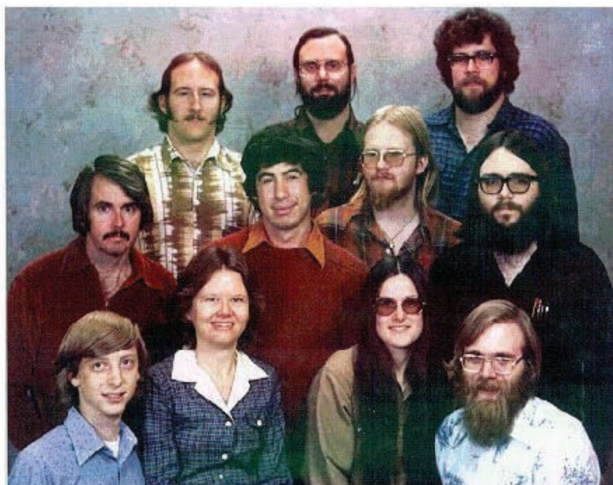
Microsoft Corporation, 1978